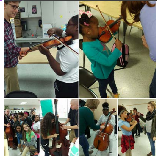
Violins, Violas and Cellos with the Belmont University String Department